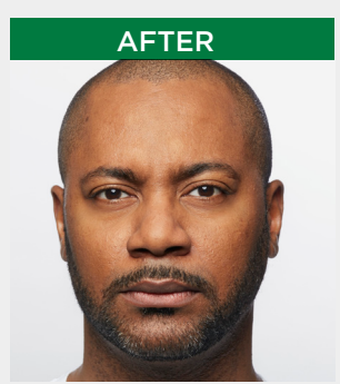
Frown after 50 units Day 14 (Individual results may vary)